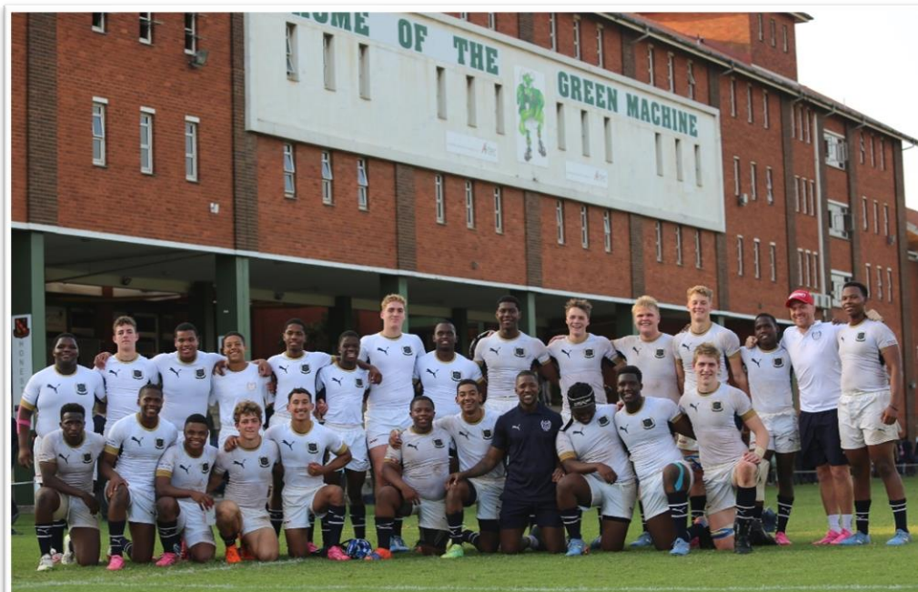
Senior Sport