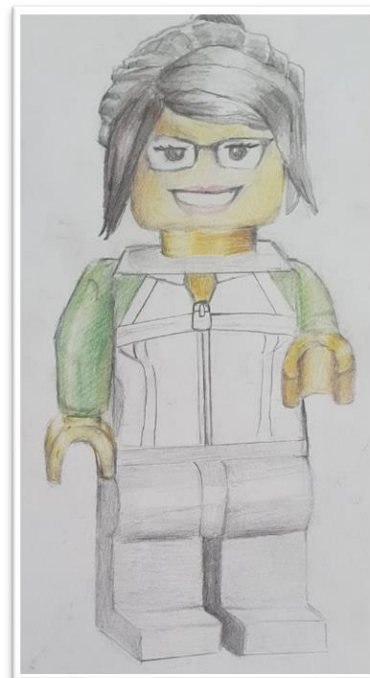
S'lindokuhle Zungu (Grade 9)