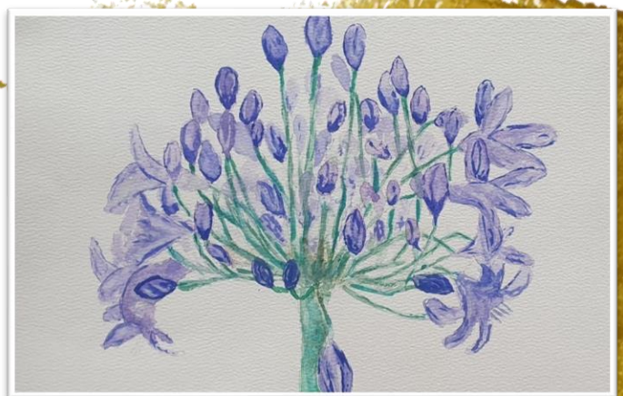
Connor Vogt, Grade 10

In addition to looking at organic forms and plants, the Grade 9 students have also been looking at how to render machine-made forms in three dimensions – a good example of this type of work is S'lindokuhle Zungu's large-scale Lego figurine in pencil crayon.