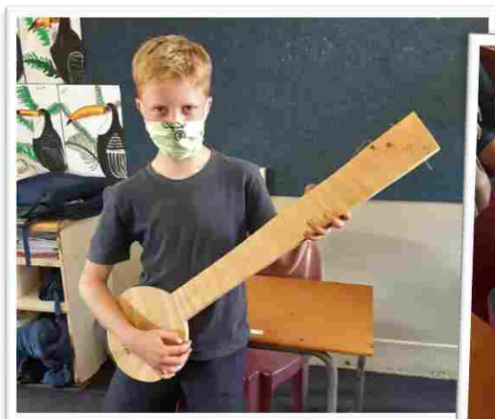
As part of this week's music project, our Grade 5 boys made their own instruments!